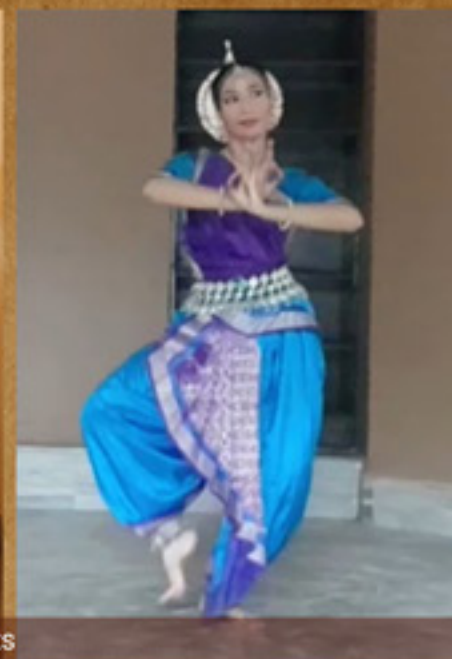
Performance Exams of BPA students