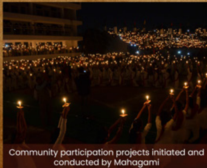
Community participation projects initiated and conducted by Mahagami