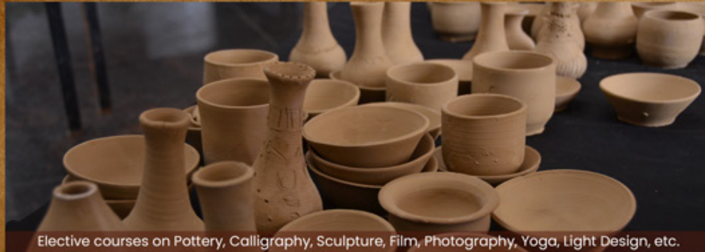
Elective courses on Pottery, Calligraphy, Sculpture, Film, Photography, Yoga, Light Design, etc.