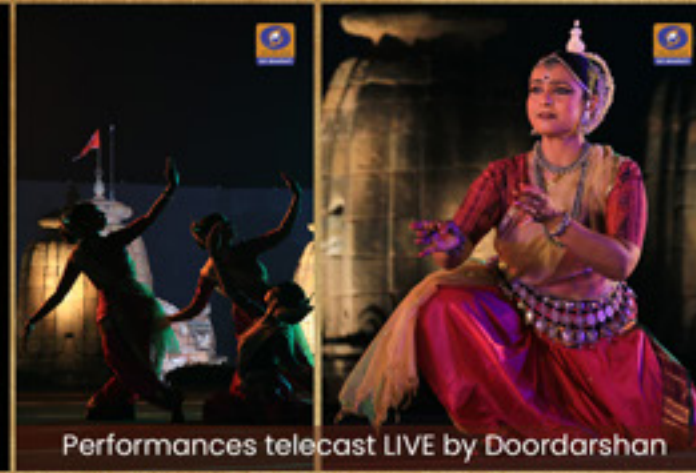
Performances telecast LIVE by Doordarshan