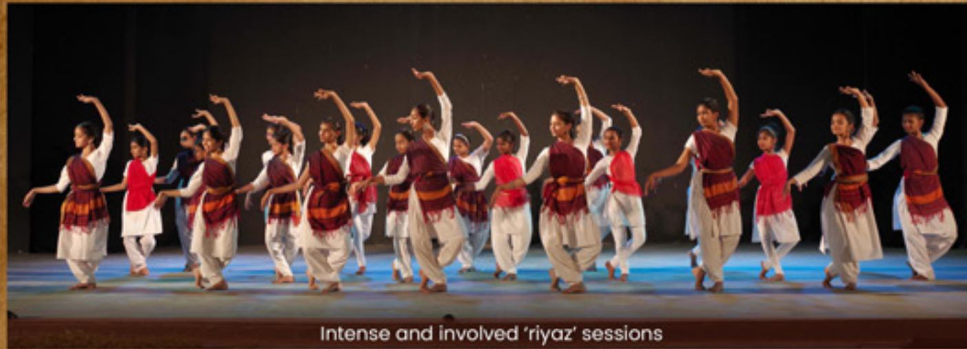
Intense and involved 'riyaz' sessions