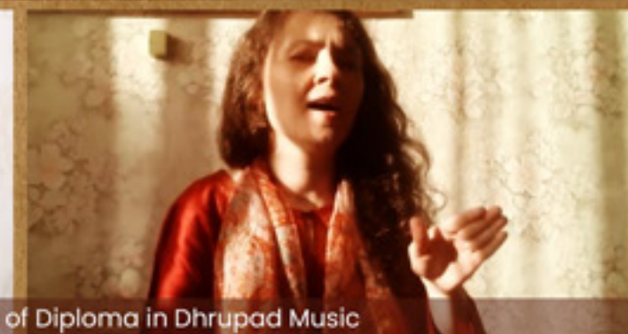
Presentations by students of Diploma in Dhrupad Music