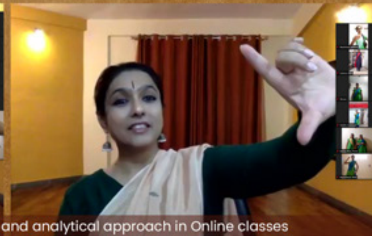
Mentoring with insightful details and analytical approach in Online classes